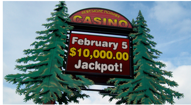
INFINITY-RGB: 20mm pixel pitch (8' x 11')