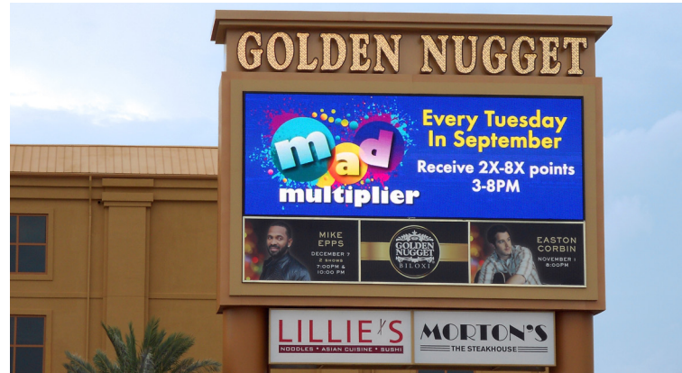
INFINITY-RGB: 16mm pixel pitch (14' x 38')