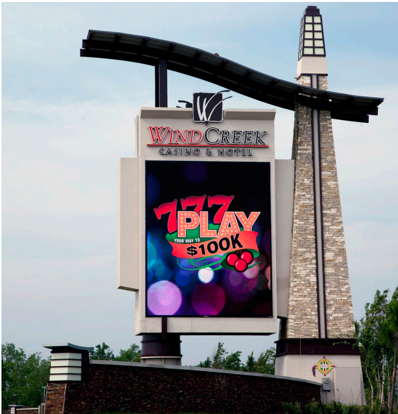
INFINITY-RGB: 16mm pixel pitch (18'-5" x 14'-3")