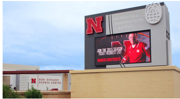
INFINTY-RGB: 10mm pixel pitch (5'-9" x 11'-11")