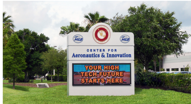
IMPACT-RGB: 20mm pixel pitch (3'-6" x 9'-10")