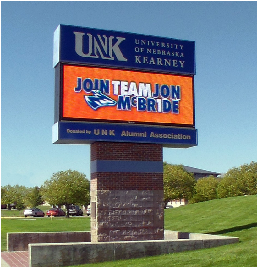
INFINTY-RGB: 20mm pixel pitch (6'-2" x 16'-2")