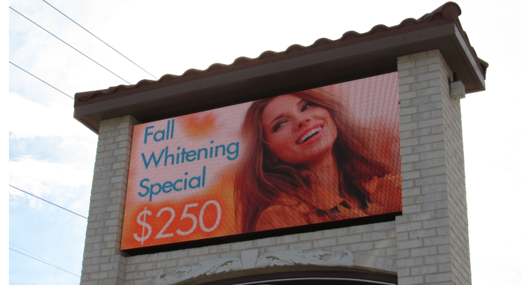
INFINITY-SMD: 6mm pixel pitch