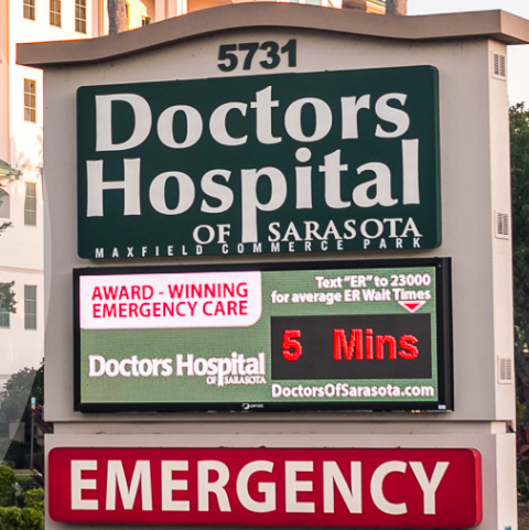
INFINITY-RGB: 10mm pixel pitch (3'-5" x 9'-8")

Electronic messages serve patients with time- and life-saving communications.