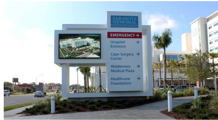
INFINITY-RGB: 10mm pixel pitch