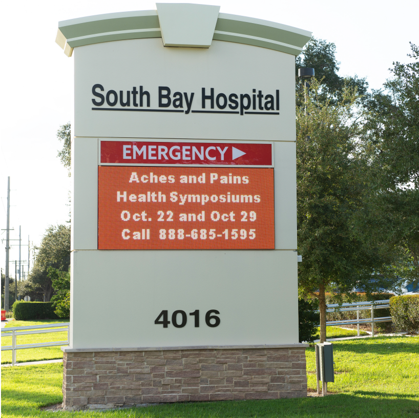
INFINITY-RGB: 16mm pixel pitch