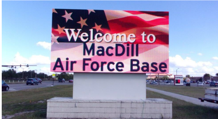
INFINITY-RGB: 16mm pixel pitch