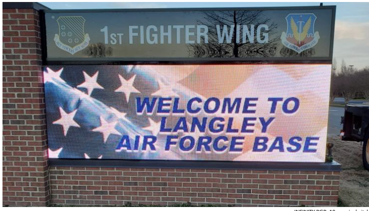
INFINITY-RGB: 10mm pixel pito