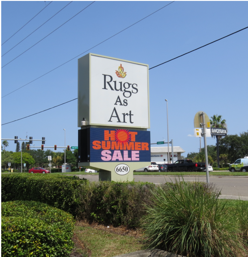
INFINITY RGB: 10mm pixel resolution