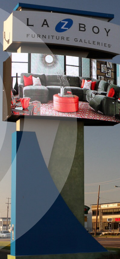
INFINITY-RGB: 16mm pixel pitch (7'8" x 15'7")

Increase visibility, traffic, and brand awareness with spectacular LED displays.