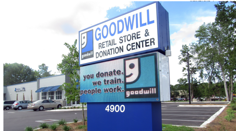
INFINITY-RGB: 10mm pixel pitch