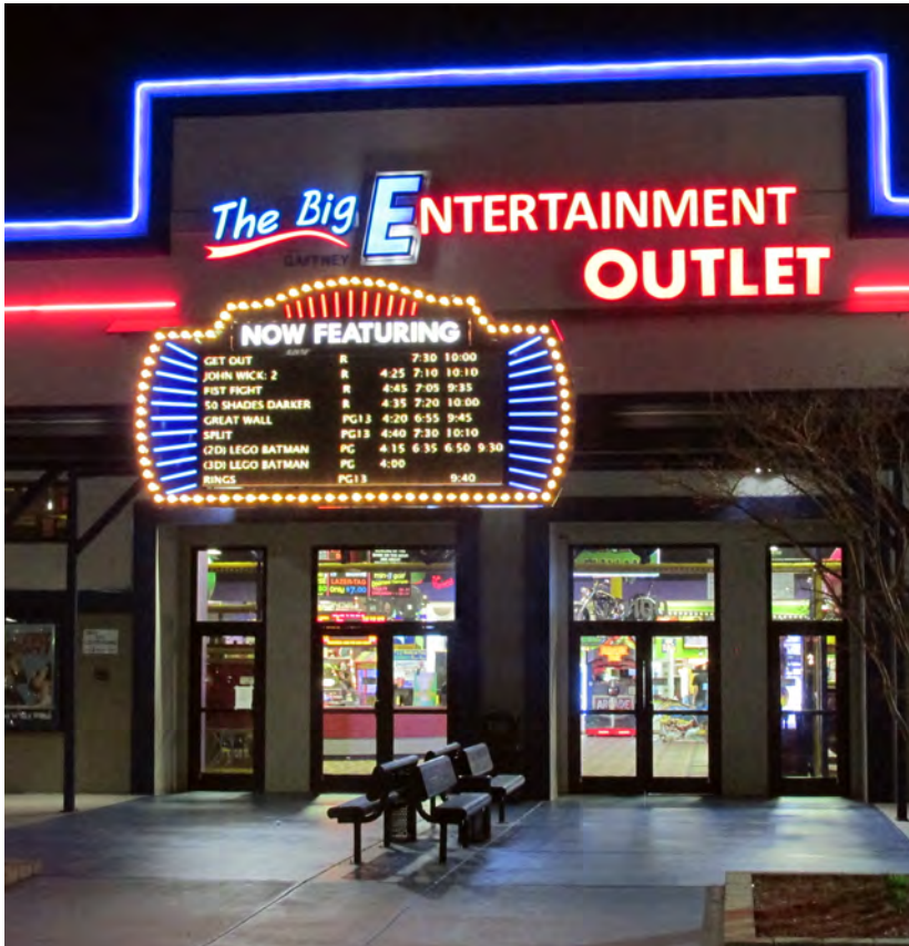
INFINITY-RGB: 10MM pixel pitch