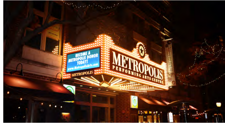
INFINITY-SMD: 8MM pixel pitch