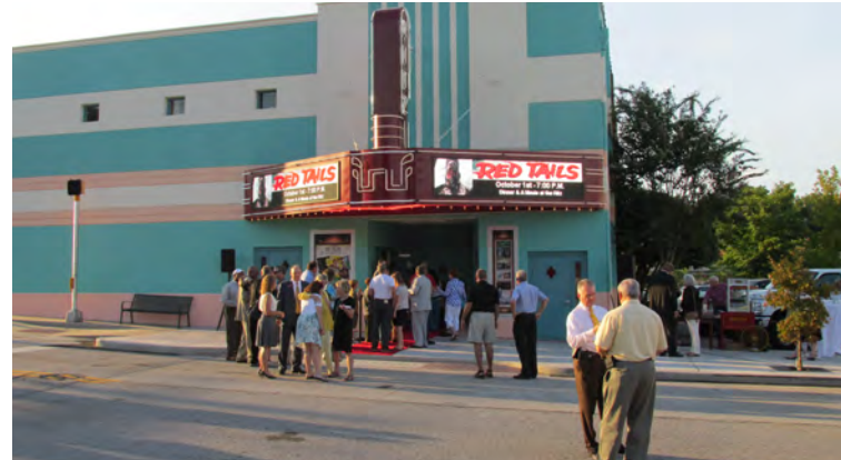
INFINITY-RGB: 10MM pixel pitch