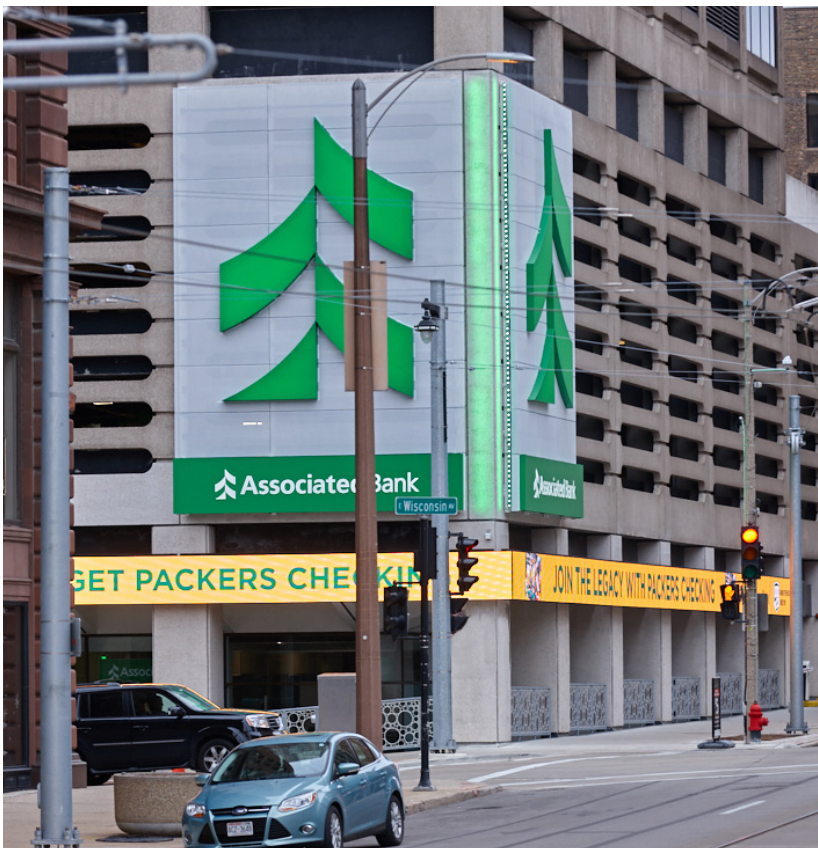
INTELLIGENT-M2: 10mm pixel pitch (3'1" x 163')