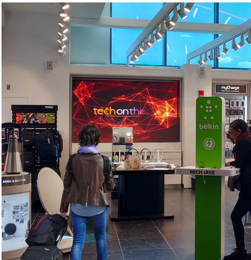
OPT-SLIM: 2.6mm pixel pitch (4'11" x 8'2 1/4")