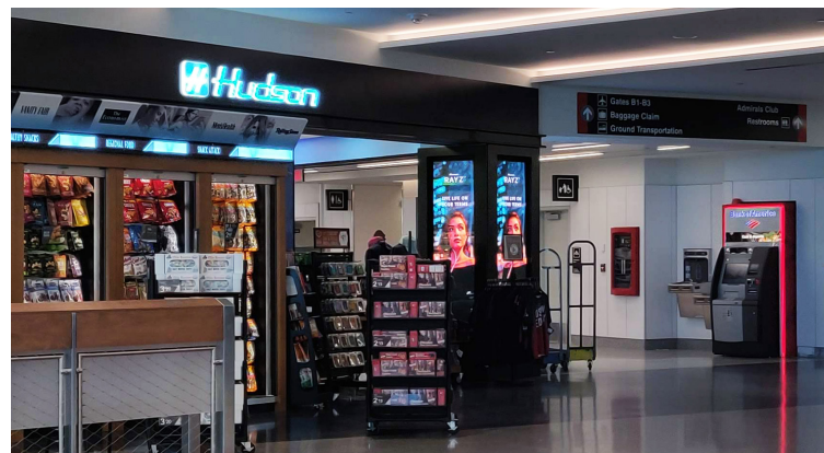
OPT-POSTER: 2.5mm pixel pitch (6'4" x 1'9")

knew that LED displays would be the perfect solution to show engaging, seamless, high-resolution video.