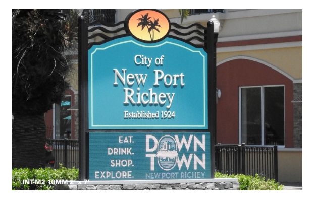
Digital signage has an astounding recall rate of 83%.

For over 35 years, Optec has advanced LED sign technology -building a reputation for quality LED signs with spectacular color, brightness, and clarity. Optec's optimized graphic and video processing capabilities deliver engaging content experiences via desktop or cloud. Whether engaging your community with brilliant graphic messages on a single sign or deploying numerous displays across your network - Optec brings years of experience working with IT teams at government, municipal and community organizations to provide safe, secure communication options.