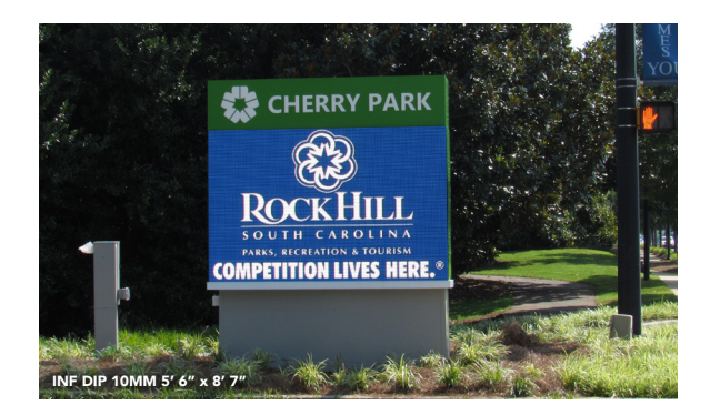
Visuals get 94% more views than text-based information.

Energize and inform people about your organization's operational goals and objectives. Digital signs promote public awareness, by keeping your community informed about all of the resources available to them like providing up-to-date news and weather alerts, promoting upcoming events, or keeping the public informed with community updates. Flexible and easy-to-use, your digital signs can engage directly with your target audience – the people in your community who see your signs every day.