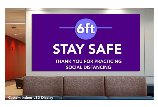
Digital signage improves queue management and reduces perceived wait times by more than 35%.

Offer a warm and inviting welcome to visitors at the lobby entrance, provide eye-catching way-finding information, or engage patients in your waiting rooms. Indoor digital signs are extremely effective in providing visual communication throughout a healthcare facility. Display doctor profiles and information about facility amenities. Promote upcoming educational events to increase attendance/participation. Diversify your outreach to the public with easy-to-use indoor digital signs that capture the attention of everyone who sees them.