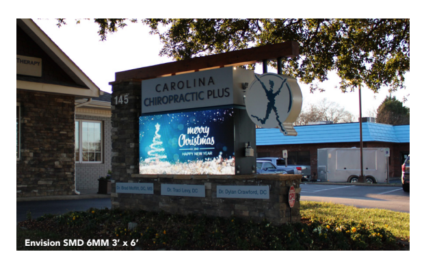
75% of those viewing a digital sign in the hospital could recall at least one message.

Digital signs will attract new patients and brand your location. Promote the benefits offered to your community by posting health screening reminders or educational events, keeping your community informed and engaged. Advise the public about services they may not be aware your facility provides. Display up-to-the-minute emergency room wait times. Adding digital signs to your location will help your organization build trust in the community by serving as a landmark for useful information.