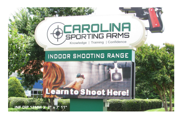
Implementing digital signage technology can increase footfall by up to 24% in retail stores.