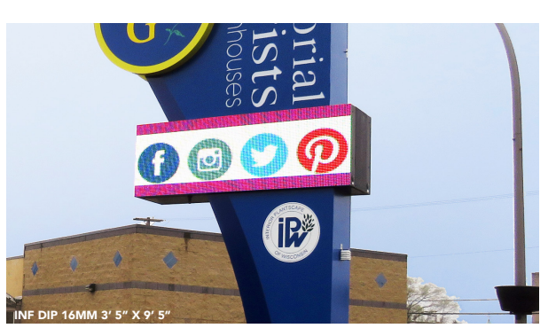
Digital displays can create a 31.8% upswing in overall sales volumes.

Brick-and-mortar retailers need to be fast and flexible to compete with online competition. Digital signs empower retailers to create dynamic and effective advertising that will engage consumers and increase revenue. Digital signs educate potential customers about your products and services by influencing their buying habits. LED sign advertising helps retailers capitalize on impulse buyers by increasing visibility and brand exposure.