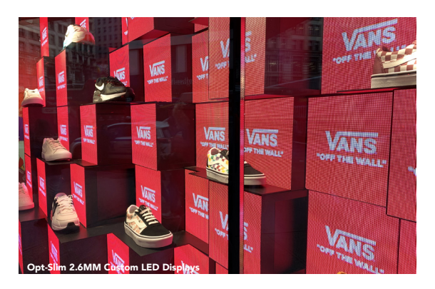
Customers spend 30% more time browsing products in stores that have deployed digital signage.

For over 35 years, Optec has advanced LED sign technology -- building a reputation for quality LED signs with spectacular color, brightness, and clarity. Optec's optimized graphic and video processing capabilities deliver engaging content experiences via desktop or cloud. Keeping confidential information secure for your institution is a priority for Optec. Optec brings years of experience working with IT teams to provide safe, secure communication options that simplify managing digital signs.