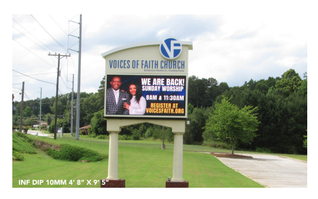
70% of practicing Christian Millennials prefer to read scripture on a screen.

Data indicates good marketing/advertising is essential to growing your congregation. Build new relationships and attract potential attendees by promoting your location, service times, and church values. Digital signage offers houses of worship the opportunity to feature accurate information to the local community to boost attendance. Highlight worship service times and empower a welcoming atmosphere for new members! An LED sign at your church extends an invitation to your community— 24 hours a day.