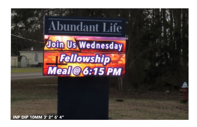
Digital signage has an astounding recall rate of 83% - almost double the information retention rate for traditional advertising.

For over 35 years, Optec has advanced LED sign technology -- building a reputation for quality LED signs with spectacular color, brightness, and clarity. Optec's optimized graphic and video processing capabilities deliver engaging content experiences via desktop or cloud. Optec's dynamic software solutions, content creation services, and U.S. based Care Team work to provide exceptional customer experiences. Our LED displays allow places of worship to promote messaging that can reach the entire community.