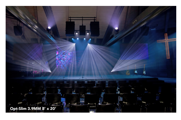
53.9% of religious organizations use some kind of digital display to deliver sermons, enhancing the experience.

Optec's indoor LED signs are modular in design. This modular design allows you to build a seamless custom video wall in any size. Ultra-high pixel density LED tiles are designed for close proximity viewing and high-resolution visual graphics. Bring light, color and movement to sermons, meetings and events. Create your own video display or choose from our stand-alone packaged products. Inform your congregation about fundraisers, service schedules, bible study times or emergency alerts.